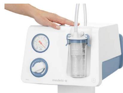
Hygienic single-piece hood design

The smooth, single-piece hood design of the pump facilitates cleaning. Materials able to withstand potent disinfection agents were chosen. The CleanTouch on/off button on the housing allows you to switch the pump on and off with a simple touch: no gaps, no grooves. The foot on/off switch integrated into the trolley leaves hands free for surgery.