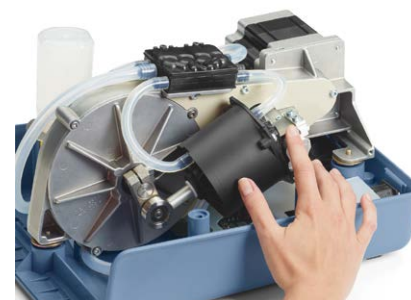
High-quality, durable components

Medela's 50+ years of experience in medical vacuum led us to refine the drive unit in the Basic suction pump. The cylinders' heat-resistant high-tech material supports long-lasting, dependable operation. A flat spring with patented technology is just one of the many features integrated into this pump.